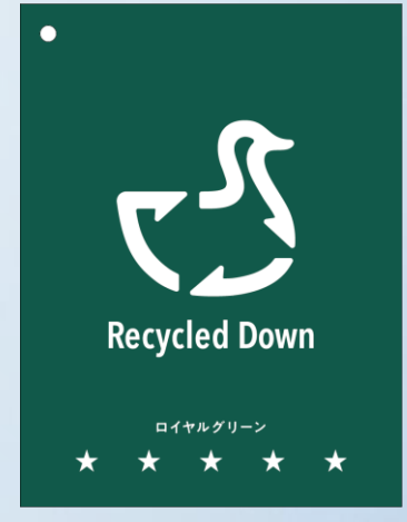
Royal Green label

New quality standards (Down quilts/Comforter) The quality standard applies to products that contain 100% Recycled down and feathers.